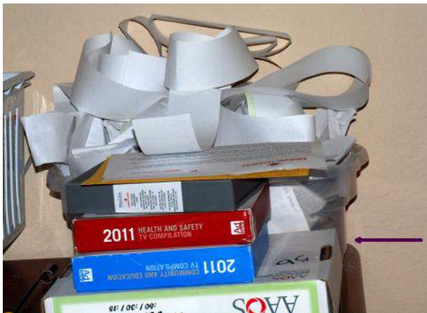
The arrow points to the bottom of the tub