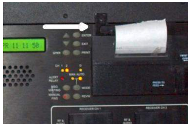
The ribbon just sits - The printout lacks print

In fact, the strips in the tub were not really clearly legible at all. In fact, they ranged from very faint (the middle strip) to the completely