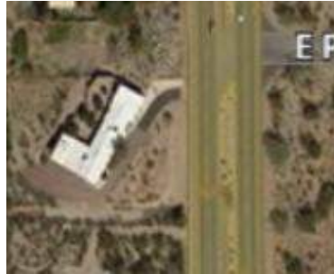
Left: Swan Road as it is today, a divided highway that bends to the right.