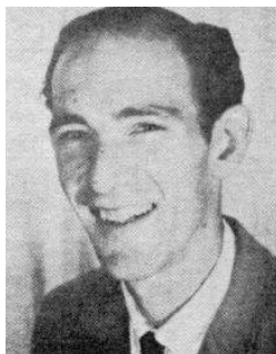
Ready to take on the heights

The bottom line: somebody had to climb the towers and change the bad bulbs. You can probably guess pretty easily who had to do it!