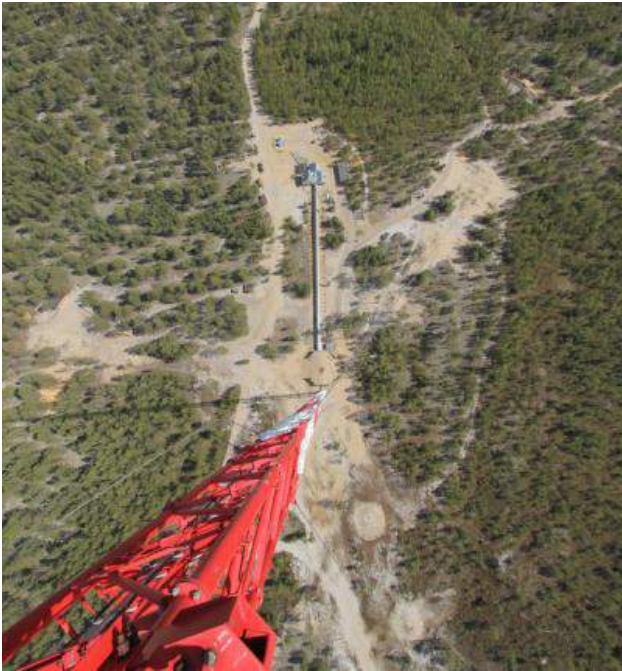
Looking down might not have been such a good idea!

My heart fluttered, my hands quivered, and I could not control the trembling in my legs. My knees shook as well. I was sure they could not support my weight.