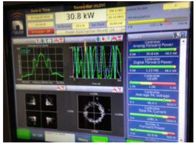
Sorry about the slightly fuzzy picture, but there it is: Full power TPO operating to cover the Front Range in Colorado!

Plus, it sounds great to have that HD kick in when tuning in 91.1.