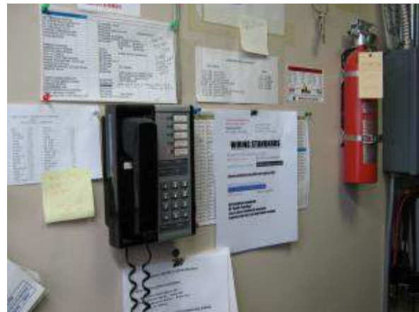
At KRVN, the wiring standards are in print and posted where our staff will see it

Please do not think about doing this – just do it!