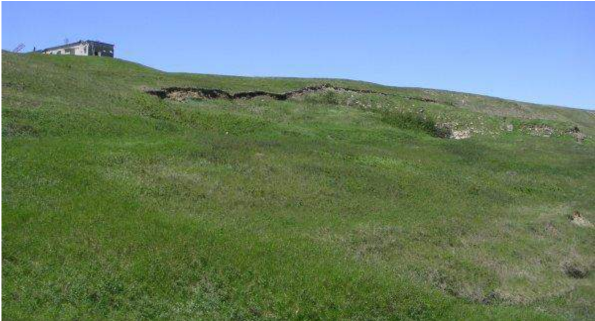
The cause of the trouble to KCAD and KZRZ. Not only did a significant drop occur, but if you notice, a large area was affected.

The Clear Channel Emergency Response Team (ERT) hit the ground running, and had the market covered with RF within 24 hours, and the larger coverage area the following day. Having had a disaster recovery plan in place certainly helped.