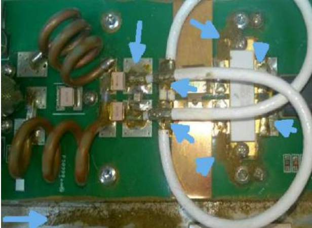
The crud accumulates!

Here is a look at another PC board. You can see how the dirt is accumulating.