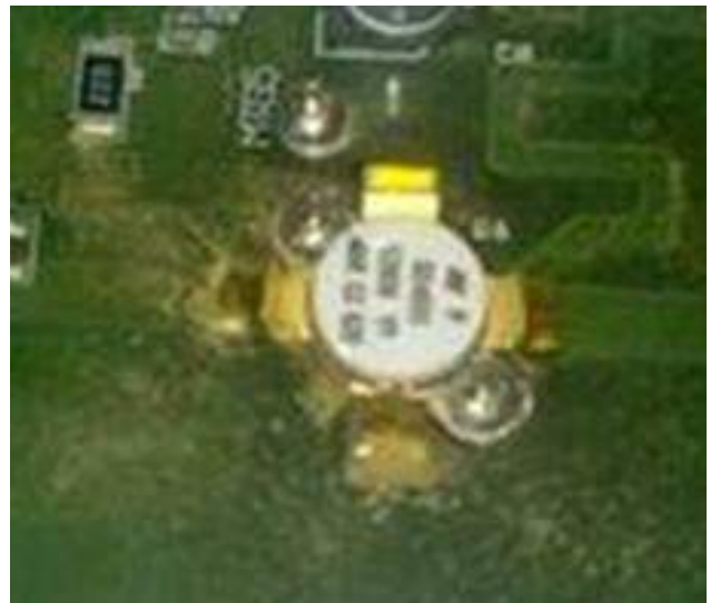
Shown here is the area around the 150 Watt IPA.

Once the transmitter was shown to operate at nominal power levels, it was time to look inside. Notice the area around the power transistor.