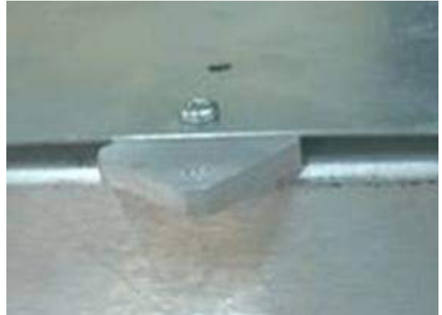
A spacer to quickly let the transmitter breathe

metal. A longer 6/32" screw was used to hold it in place on the chassis.