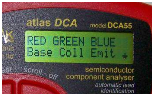
The lead identification

Just clip the leads on in any order and press ON. The DCA55 finds the proper pinout and tells you what each lead is.