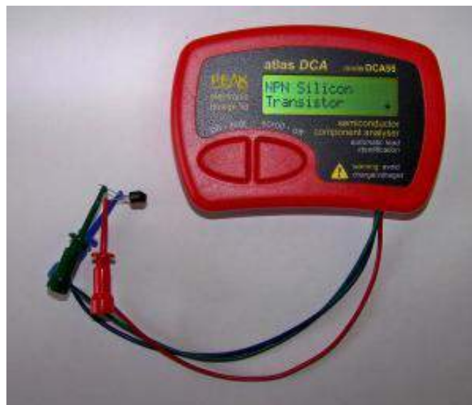
The Peak Atlas DCA55 automatically identifies the device under test.

Want to identify an unknown component? All it takes is to just clip the leads to your LED, bipolar devices, FET, MOSFETs, SCR's and Triacs and press the "on - test" button. Immediately, the DCA55 identifies the device.