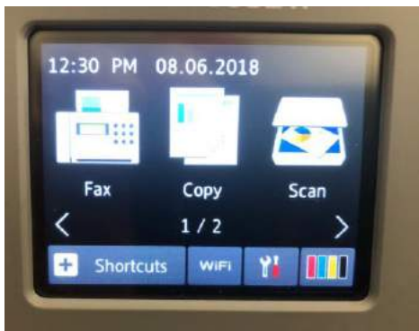
Front Panel quick selections

Using the printer is easy. Setup links it to your applications on desktop, laptop, smartphone or tablet, or right from the 2.7-inch touchscreen.