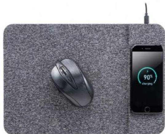
Allsop PowerTrack Wireless Charging Mousepad

This is exactly what I found with the Allsop PowerTrack Wireless Charging Mousepad . It has a pleasant grayish color and feel, with a fairly non-slip backing. But as its name implies, there is even more value here.