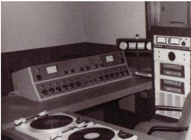
A Crouse console built for WGVL, Greenville, TX