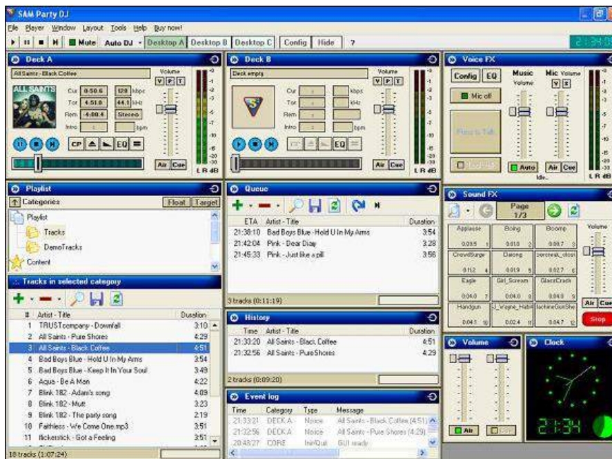
The SAM Party DJ main screen

SAM Party DJ is the little brother of SAM Broadcaster. The main difference between the two products is ads, program scheduling, Internet interaction, $150 and streaming support. There is a free 14-day trial, and the $129 price point provides more than enough value to justify the cost, even if you only use it on occasion.