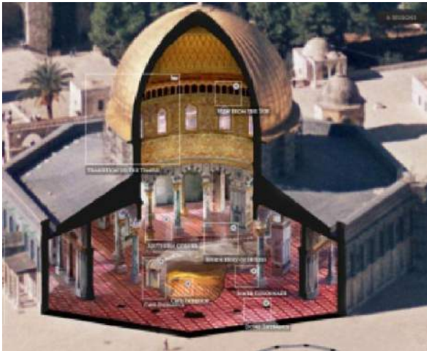
By clicking on the picture, you can move around and go inside the mosque

An example is found with the Dome of the Rock Mosque. Glo does not just give you a few photos. It gives you views of the mosque from quite a few views and inside and out.