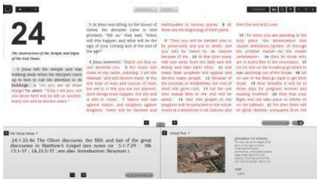
A large window makes reading the Bible easy

The bottom part of the page is made up of two different parts. One side is for study notes and explanations of key terms for the Bible reading, if there are any. The other side will display artwork relating to the passage on the page above.