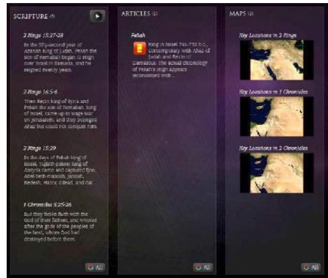
Everything you ever wanted to know about Pekah

Once you have gotten to down to Pekah, click on his name and Glo opens up with a variety of material on him.