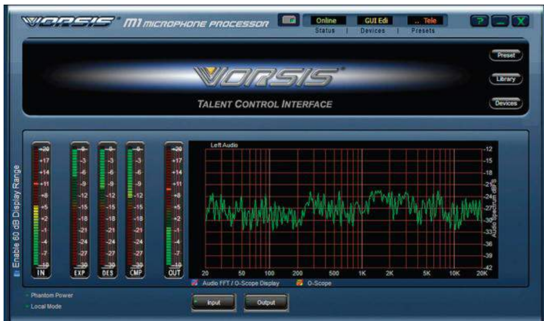
The Vorsis Talent Control Software

The front panel controls may look a bit confusing at first but are pretty easy to deal with once you set it to some of the default settings – which, by the way, can be also done by utilizing the included Vorsis M1 software.