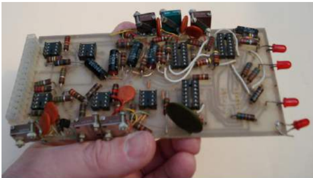
M-101 prototype card – The Audio Prism's heart

But if the control starts moving fast enough that there is a noticeable AC component on top of the DC, modulation takes place in the multiplier and the output has sum and difference frequencies that were not present in the VCA audio input. It gets ugly pretty fast.