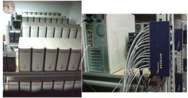
The cluster computer in these photos has been used to design 50 kW upgrades for directional AM stations in Detroit, Baltimore, Boston and Chicago.