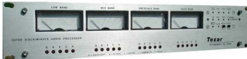
The first production version TEXAR Audio Prism

Immediately, we started work on #3 and #4, largely because we had no idea how long 1 and 2 would keep working.