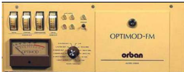
The Optimod 8100A

Orban introduced the 8100A in 1981. The new model was a significant improvement on the 8000A, going on to become the most successful Orban product – and became perhaps the best selling broadcast processor of all time, with approximately 10,000 units shipped. Like the 8000A, the 8100A featured an integrated stereo generator which virtually eliminated overshoot, and gave FM stations the ability to modulate right to the limit, as with AM, and adding an incremental increase of loudness.