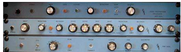
The early CRL AM System (eventually there was a shiny black face)

Jones was the first to utilize “pre-distortion” in an AM processor to cancel out transmitter problems like the “power supply tilt” and thereby increase modulation a bit more.