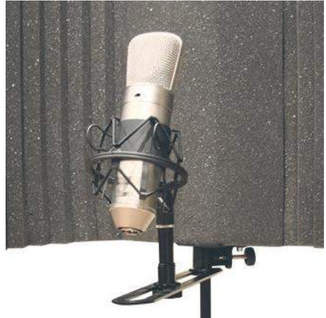
The MudGuard mounts easily

Having a little custom product like this makes it easy to carry and set up. The MudGuard easily mounts on most microphone stands.