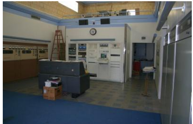
WJR's Transmitter Hall, with a DX-50 main, and 317-C2 and MW-50 backups

WJR continues to serve the Detroit market with a news and talk format. Over five decades, WJR changed as the industry changed, slowly shifting from a Full Service station to a News-Sports-Talk format. More recently the emphasis is on the Talk format, both local and satellite delivered, along with a re-worked Sports presentation.