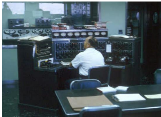
WJR Master Control in 1964

CapCities/ABC/Disney operated the station for 42 years, selling it to Citadel Comm. in January 2006. In September 2011 Citadel merged into Cumulus Media, the current ownership.