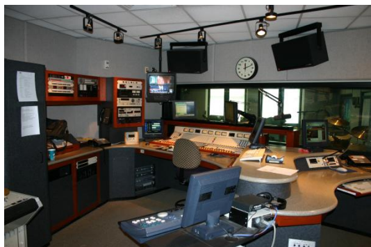
The new WJR Master Control in 2006