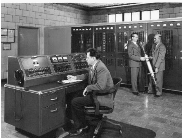
WJR's Transmitter Control with its new 50 kW Western Electric 407 transmitter.

Of course, it was not all easy, in November of 1940, heavy winds knocked over the station's 733-foot tower. It was replaced with a slightly shorter, 700-foot tower.