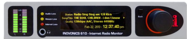
The Inovonics 610 Internet Radio Monitor

A new tool to help us to accomplish that is the Inovonics Model 610 Internet Radio Monitor.