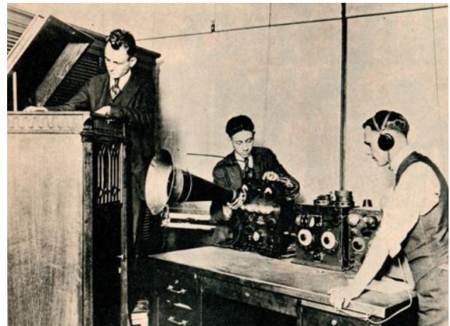
The scene on August 20, 1920, from a WWJ 1970 promotional piece

The station officially began operations on Friday, August 20, 1920.