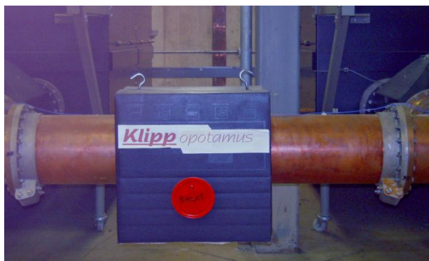
The World Famous Klippopotamus on guard

Intrigued by Bill’s imagination, we decided to go a giant step beyond the diodes and create a passive audio clipper that worked in the RF domain. We set the “Klippo” up to process all of the stations by clamping it to a section of 9-inch rigid transmission line, supposedly making the playing field really even for all stations.