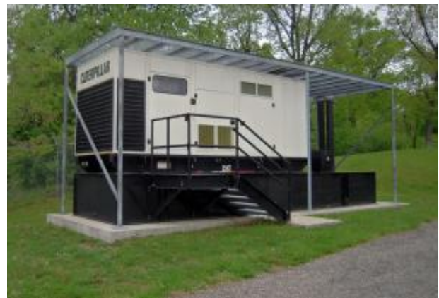
The 1 Megawatt generator, ready for action

Additions: In 1997 station #9, then WXPT-FM, 104.1 MHz was added to the combiner string. And, as we had preplanned for emergency power, during 2006 a 1 Megawatt generator with lots of fuel capacity and transfer switches was added to the site.