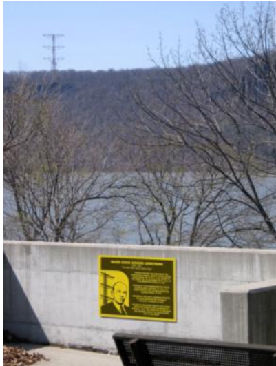
View from Yonkers to Alpine (the plaque is simulated)

Scarcely eight yards north of the statue is the Greystone Train Station with a beautifully unadorned stairwell wall (the stairs go down the side of the cliffs to the station) and a great view of the Armstrong Tower to boot.