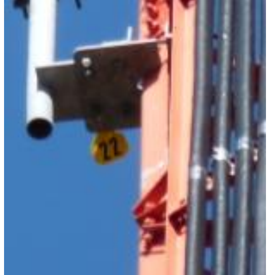
It is easy to see exactly where the line number 22 ends up!

As you can see, the cool part is that they are easy to read. Positioned correctly, the tags can be read, using field glasses, several hundred feet above the ground. Whether at the transmitter site or at the studio for the STL tower, this is a great way to know for sure exactly which line goes where.