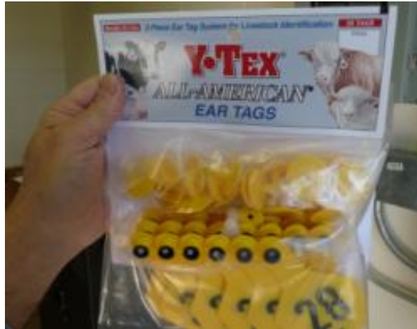
A bag of Cow Tags

If you have cattle in your area, take a look and you will see transmission line tags on the hoof! These tags are attached to the cows' ears and provide a long-lasting means of telling which cow is which.