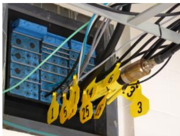
In the transmitter room egress

In this application the conventional application method is discarded in favor of a clamp around the transmission line.