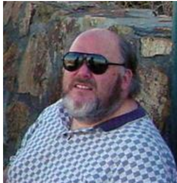
By Dana Puopolo

[November 2011] It is always nice to save some cash, especially when money is tight. But any time you can stretch your budget to cover more purchases, it makes management happy.