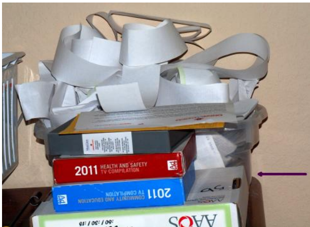
The arrow points to the bottom of the tub