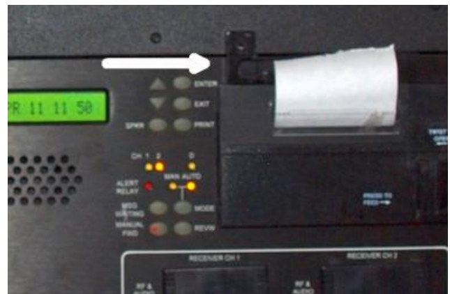
The ribbon just sits - The printout lacks print

In fact, the strips in the tub were not really clearly legible at all. In fact, they ranged from very faint (the middle strip) to the completely