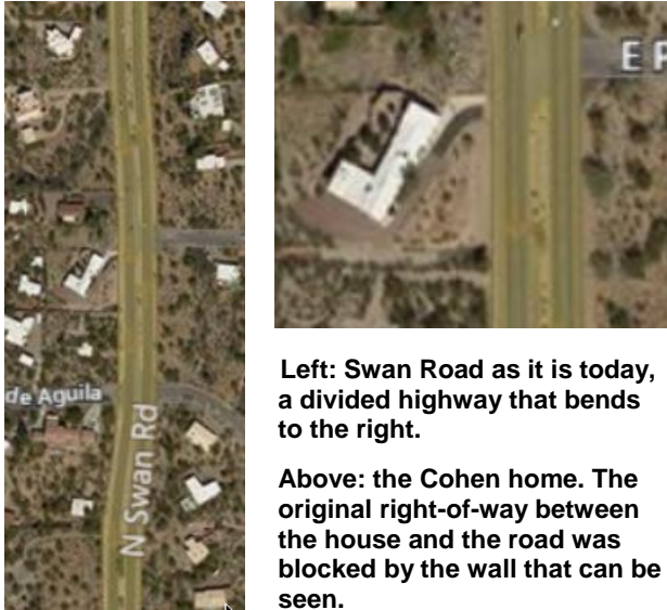
Left: Swan Road as it is today, a divided highway that bends to the right.

Anyone looking at map today might wonder why Swan Road, straight as an arrow over 98% of its length, suddenly jogs to the East north of River Road – exactly where the Cohen’s house was located.