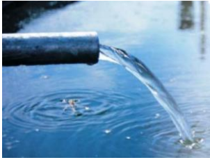
A pipe carries water

To get water from one place to another, you need a pipe. To get electrons from one place to another, you need to use wire.