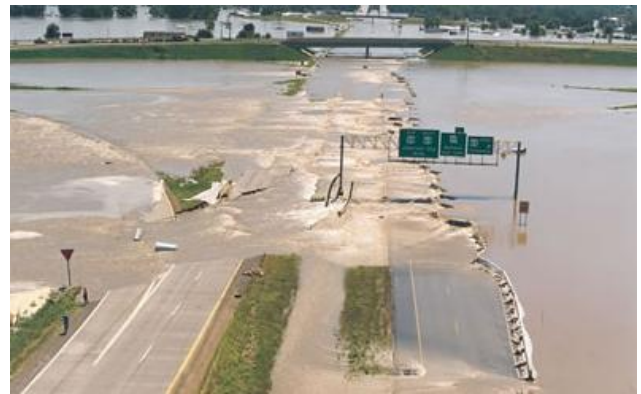
When a lot of water is amassed, pressure results

To get more water through a pipe, you need to increase the input pressure – or increase the size of the pipe, reducing the resistance to the water flow. In an extreme case, with too much supply, bad things happen.