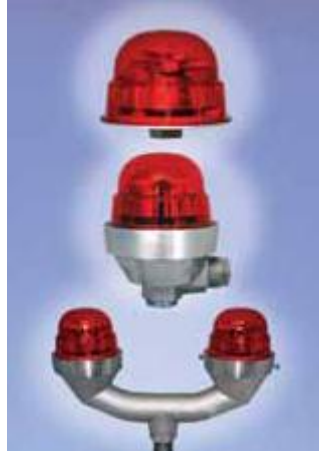
The L810 RTO Series draws 6.5 Watts of power.

Furthermore, an LED tower lighting system should have lower maintenance costs than strobe and/or incandescent lighting. LED Beacons have an expected 10 to 15 year lifespan. The higher initial capital outlay for beacons ($2,500 for LED versus $1,300 for incandescent) and side lights (LED sidelights only use 6.5 Watts of power with a purchase price of $150, incandescent sidelights use 116 Watts of power with a purchase price of $100) should be regained in a very reasonable period of time with savings in both power costs and maintenance.