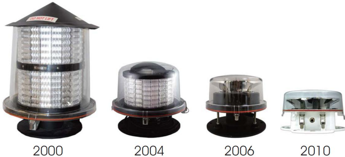
Dialight LED beacons – the technology definitely has advanced over the years.