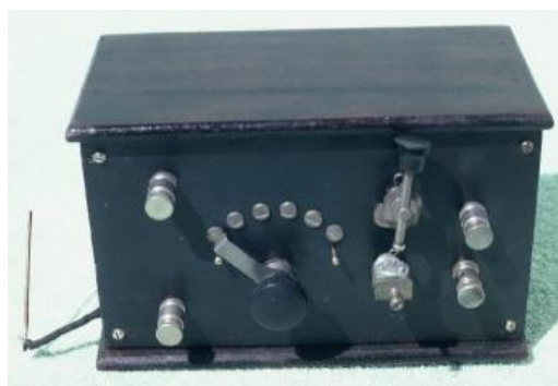
The original Harko

The sales of the Harko in the 1921 Christmas season were so successful that Crosley stopped building anything else but radio receivers.