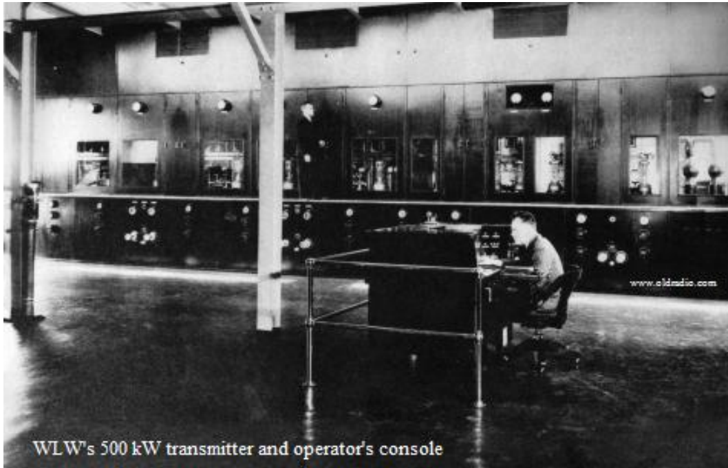
WLW's 500 kW transmitter and operator's console

For perspective, notice the man on the catwalk just to the right of the middle post.