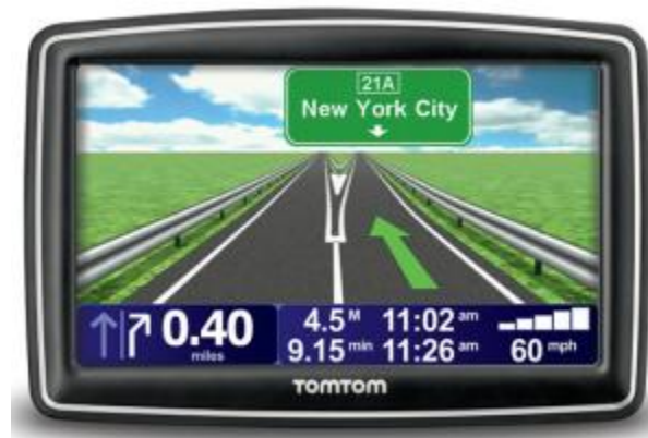
The TomTom XXL-540S clearly indicates which lane you should take

With the TomTom, when a driver approaches an exit the screen changes to a depiction of the highway with separate lanes. The lanes you need to use to make the exit have a green stripe to indicate where you should be.