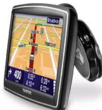
The TomTom XXL-540S

Recently I was asked to review one of TomTom's newest GPS units; I got hold of an XXL-540S model.