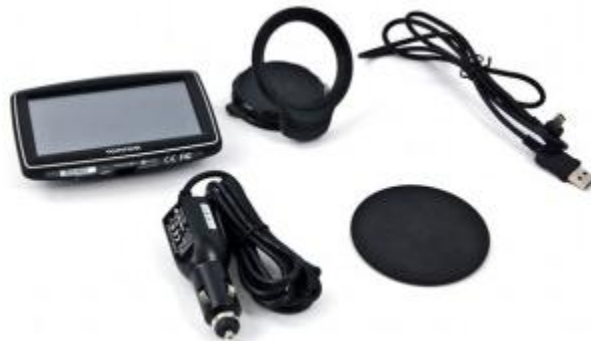
Display and mounting materials for the XXL-540S

The main complaint I have - and user reviews back me up - is the mounting bracket. It has the usual suction cup mount to the windshield as well as adhesive dashboard top mount disks. TomTom calls it the "EasyPort™" mount but that is a misnomer. It should be renamed the "ToughPort" mount.