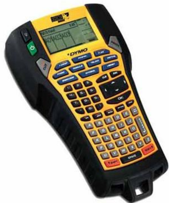
The Rhino 6000

The latest and greatest Rhino is the Model 6000, with capabilities that meet virtually any labeling need you can think of. IT workers and engineers installing studio and transmitter site gear will find this a dream to work with.