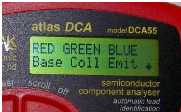
The lead identification

Just clip the leads on in any order and press ON. The DCA55 finds the proper pinout and tells you what each lead is.