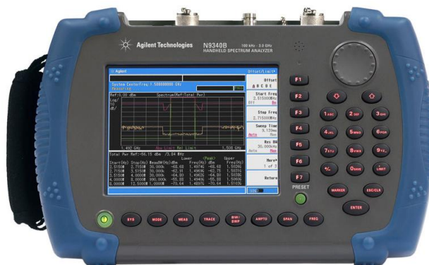
The Agilent N9340B