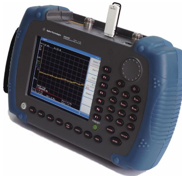
The USB connection allows data to be easily downloaded to a flash drive

Photos, data plots, arcane data files, a printout, a floppy disc - all have been used for data transport from field to office, but the N9340B uses none of the above. Instead, there is a USB slot to allow connection of a standard memory stick or thumb drive. Loading spectra in JPEG form is simply a few clicks on the menu screens, or the data can be left in the instrument and downloaded as the onboard memory fills up.