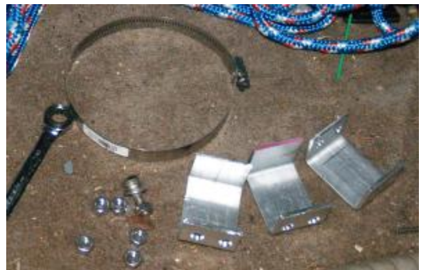
The repair parts on the bench, at slightly less than $1000

First I cut out three 4-inch long sections and made two 90-degree bends, 1-inch from each end giving a C shape. I then predrilled one end of each of the three straps centering two holes 3/4-inch apart to match the existing holes in the feed arms.