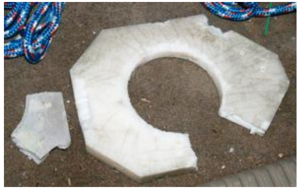
This mounting plate was not going to be of much use

After a bit effort I was finally able to break out a section and remove the feed horn. A hack saw would likely make the job much easier. Once I got the feed horn on the bench and disassembled everything, the problem with the broken mounting plate was obvious.