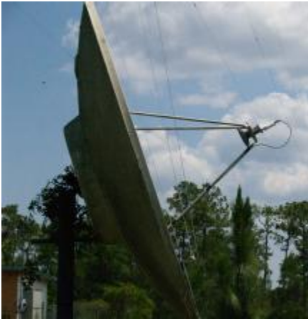
The feed horn is askew in relation to the dish

A visual inspection quickly confirmed the problem, when I saw the feed horn pointing below the center of the dish.