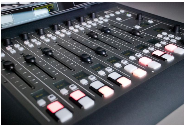
The Axia iQ

The Axia iQ is a small form digital console which debuted at the 2010 NAB Convention in Las Vegas. It is a lower cost addition to the Axia's line-up of networked audio consoles and devices. Like all Axia products, it is based on Livewire audio-over-IP technology.