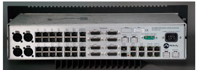
The back of the iQ core engine

The heart of the system is the iQ core which is a mixing/processing engine with power supply, multicast-enabled switch and I/O interface – all in a three rack unit enclosure.